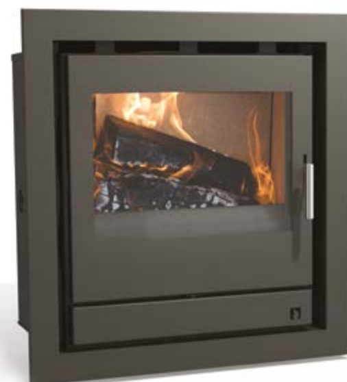
Ecoboiler 12 Cassette | 11.8kW A