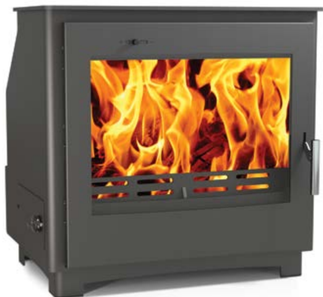
Ecoboiler Wood | 11.8kW A