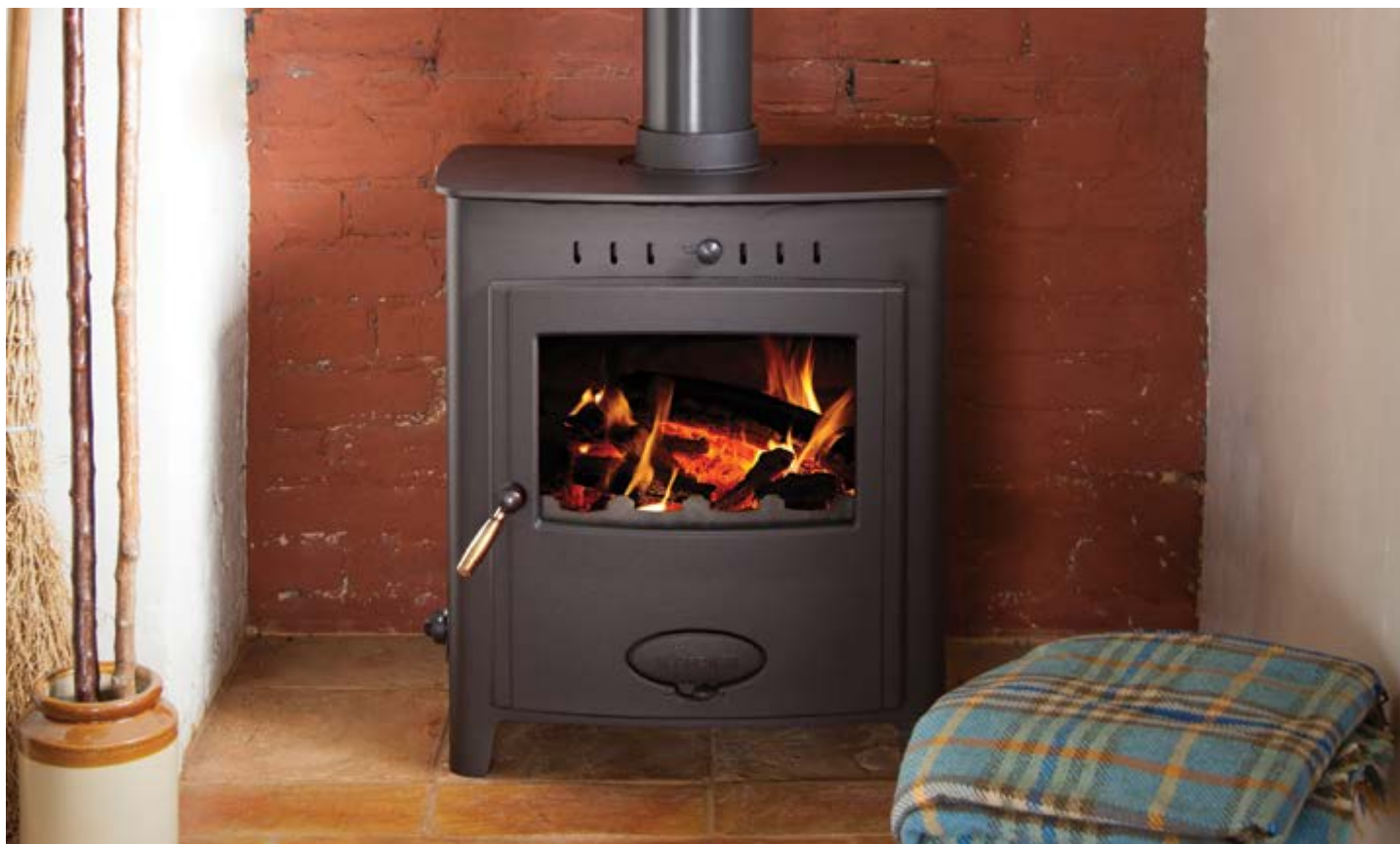
Model shown: Ecoboiler 16 HE | 13.6kW

Providing more than just superior performance, the Ecoboiler HE (high efficiency) has a large fire door glass and soft curved lines, offering an attractive focal point for any living area. On top of its stylish appearance, discreet thermostatic control and three bar operating pressure, its ability to produce 50% more heat to water than other boiler stoves ensures the Ecoboiler is the ultimate heating companion.