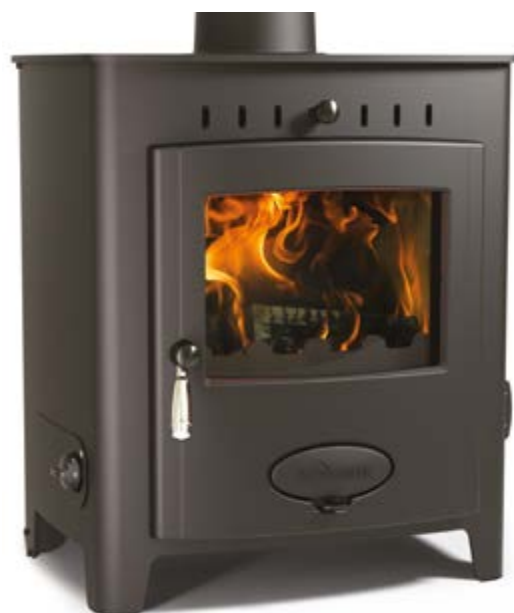
Ecoboiler 12 HE | 12.1kW A

Available with 12.1, 13.6, 18 or 22.5kW outputs