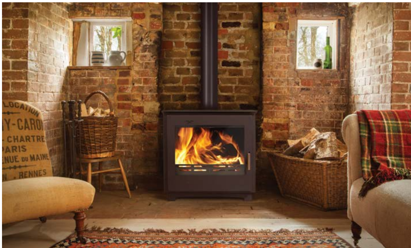
Model shown: Ecoboiler Wood

Our dedicated wood boiler features one of our biggest viewing glasses, providing an unhindered view of its glowing fire. Featuring a modern design, clean-cut lines and a sleek handle, the wood boiler is certain to become the centre point of any room in an energy-conscious home.