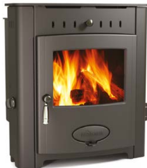
Ecoboiler 16 HE Inset | 16.1kW A